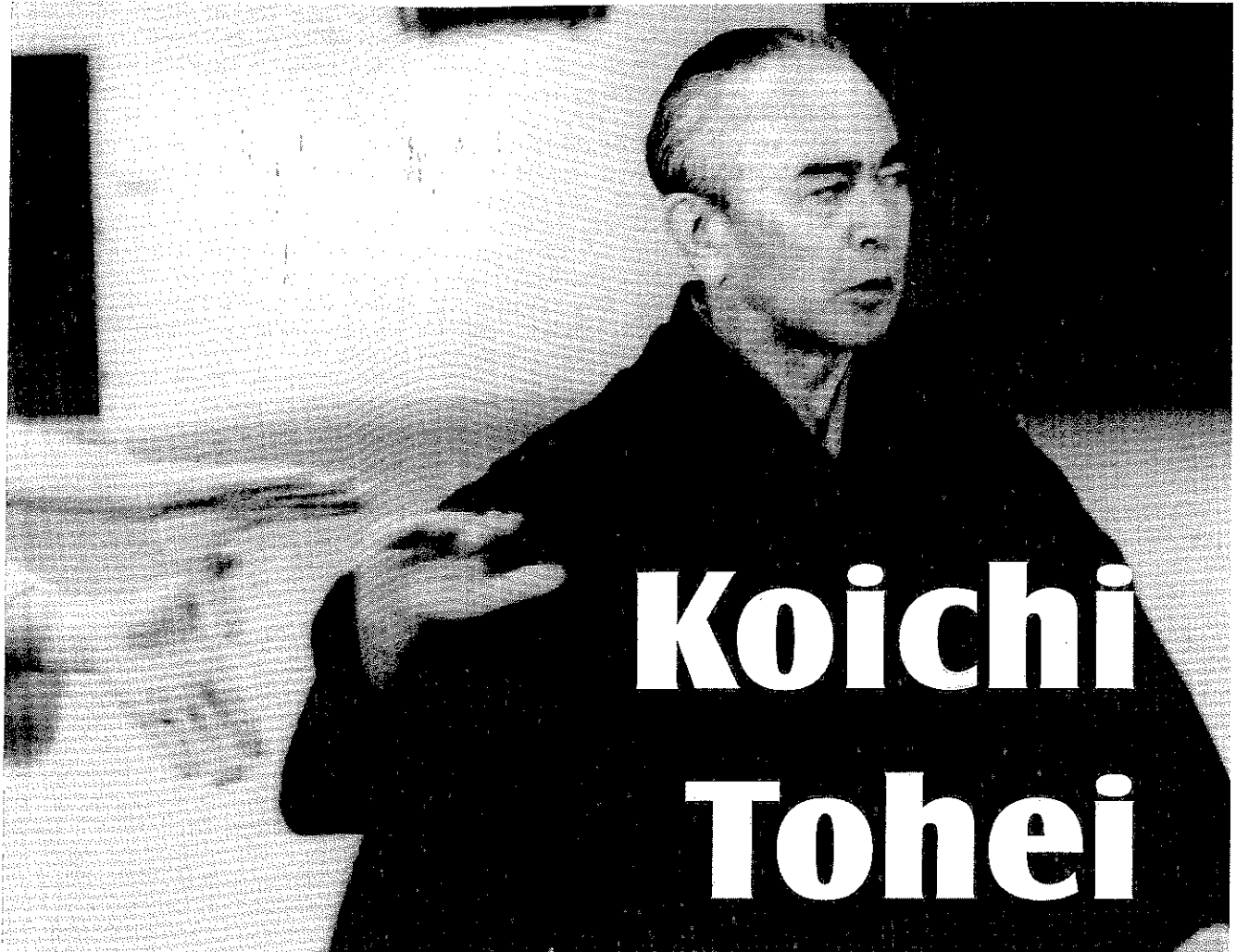
Tohei demonstrating the principle that "the mind moves the body"

Exclusive interview with Koichi Tohei, Aikido 10th Dan and Founder of the Ki Society