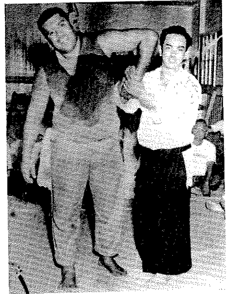
In Hawaii around 1953